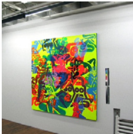
Women Painting 3, 2010 studio view

However, these black light paintings are built with fluorescent paints. My use of fluorescent paints under the black light color spectrum is a strategy to force a singular time/space experience with the work. That is to say, the work must be experienced in person, and cannot be fully appreciated through reproductions via jpegs or printed catalog pages.