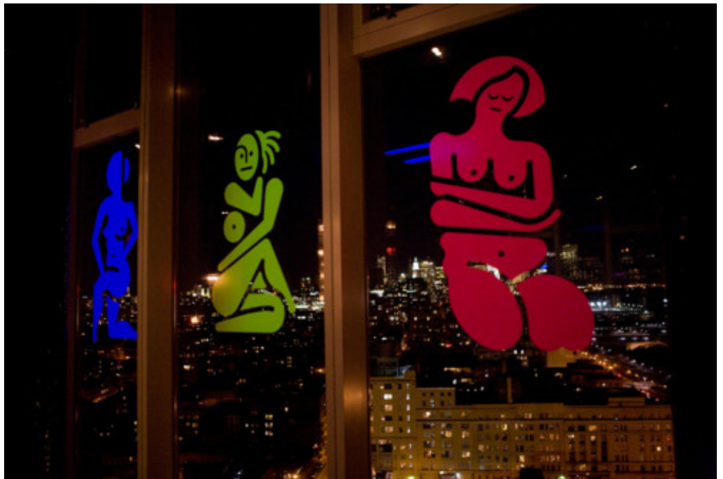
(Ryan's Installation at Le Bain)

The Standard: You've been working with iconic universal signals for most of your career. Can you remember the first moment it dawned on you that you wanted to "sexify" them? Can you remember how the process unfolded?