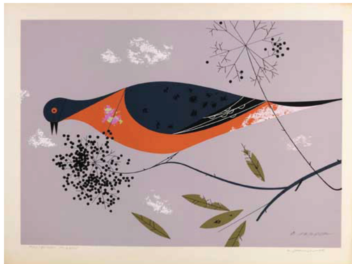
Passenger Pigeon , 1957 - Charley Harper, Screen print - 13 x 18 1/4" - Collection of the Estate

CINCINNATI, OHIO – The whimsical art of one of Cincinnati’s most respected and loved couples, Charley and Edie Harper, will be the subject of an exhibition later this summer at the Cincinnati Art Museum. Minimal Realism: Charley and Edie Harper, 1940–1960 will include 40 works by both artists. This exhibition will remain on view Aug. 18 through Oct. 21.