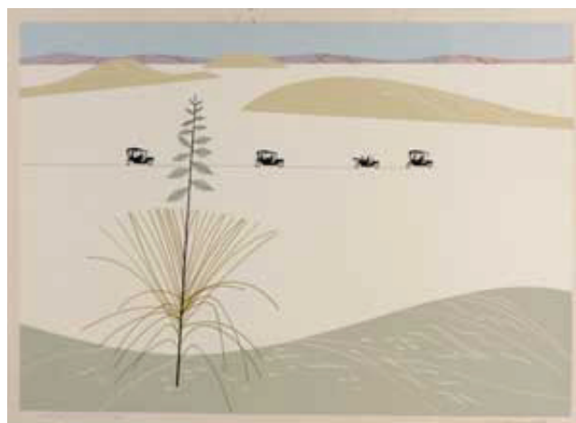
Charley Harper, White Sands, N.M. , 1952, screen print - 13 x 18 1/2, Collection of the Estate, © Estate of Charley Harper

Located in the nearly 200 acre Eden Park, the Cincinnati Art Museum has an encyclopedic collection that ranges from ancient Egyptian and Greek works of art to paintings by European masters to pieces by modernist and contemporary artists in all media. Some of the Museum's most notable holdings include the only collection of ancient Nabataean art outside of Jordan, the renowned Herbert Greer French collection of old master prints, and an outstanding collection of European and American portrait miniatures. The Museum has an active program of organizing and presenting traveling exhibitions and presents a wide range of arts-related programs, activities, and special events. General admission is always free.