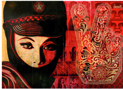
Shepard Fairey, Mujer Fatal

Art Basel Miami Beach Miami Beach Convention Center Miami Beach FL